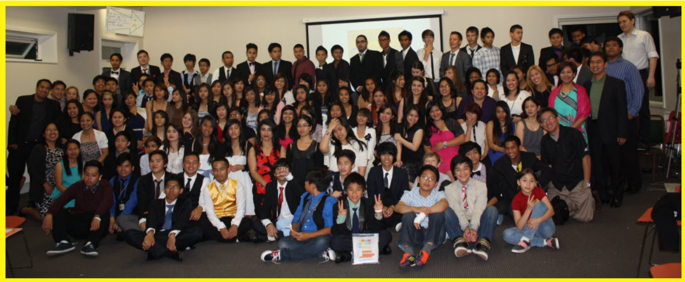
From page 1