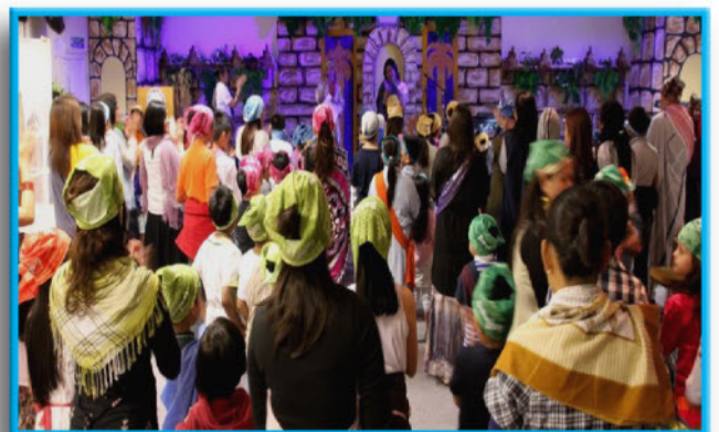
BABYLON 2012 goes to WIN Ireland