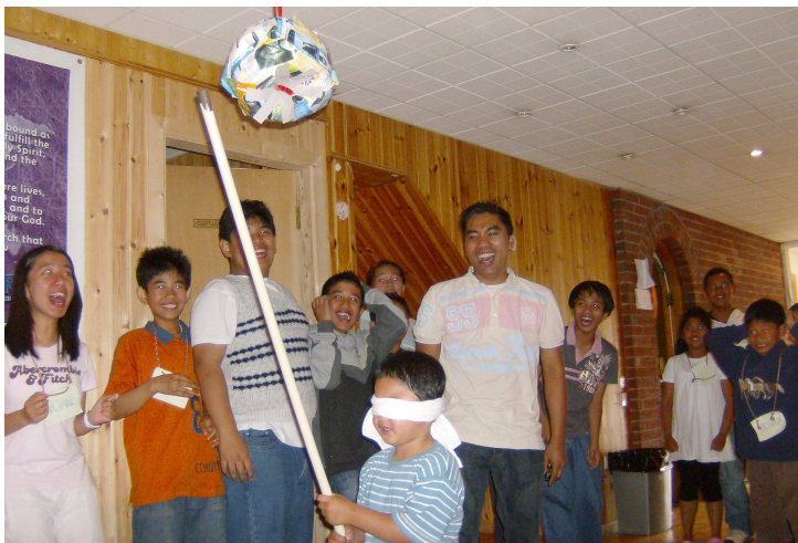
Waste Watchers - Summer 2009