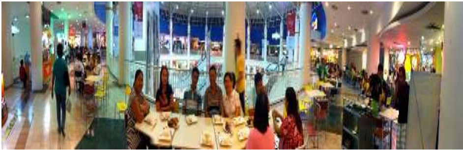
Above: Time to relax at the Ayala Center