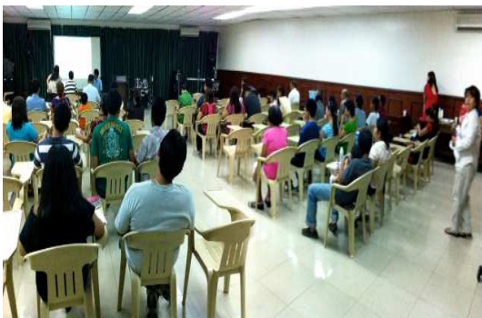
Bottom Left: WIN Cebu City Sunday Worship Service. The profile of the church is young and fresh. They are now lead by mostly young adults. They have a plan to put up an afternoon service to cater to the professionals that have broken working schedules.

If you want to see more photos please visit my Facebook album. Thank you for viewing and praying.