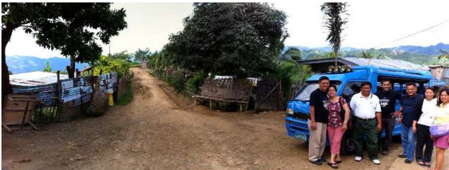
Above: Point of Entry to the Outreach in Bgy Sibugay from the highway. It was about an hour travel from the City.