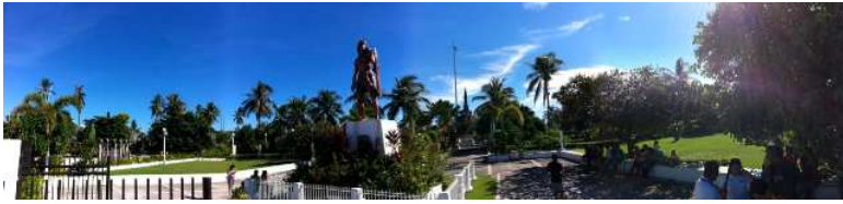
Above: Lapu-Lapu shrine. Inspiring Filipino Warrior. It's time we shine, like the good ole days. Go, go, Pacman!