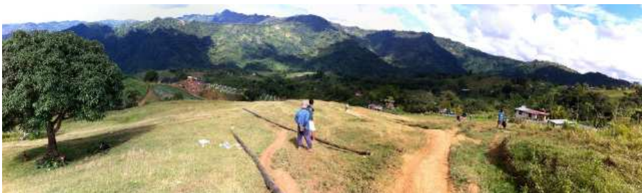
Above: This is the front yard of WIN Sibugay Outreach! Expansive. The pioneering outreach is at the far right end of the road (not seen).