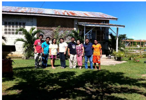
Middle Right: Cordova Outreach with a very conducive place of worship center at the background. The outreach is strategically located within walking distance from the Barangay hall. Today, it is in the middle of a young community but the projection is that a highway will be built opening access to the subdivision. The vision is very good. Low investment but long term in dividends.