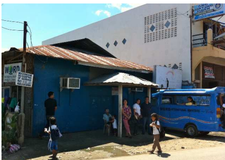
Middle Left: Frontage of WIN Lapu-Lapu City. This is a major church in Cebu, planting outreaches and supporting ministries. We are on our way to their outreach in Cordova.